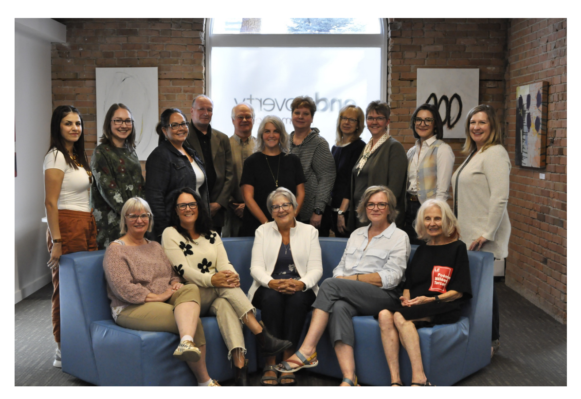
An ECELC gathering at EPE's downtown office in 2023

The ECELC builds on existing capacities and provides leadership in managing, planning, and supporting the development of a system of high-quality early learning and care services in Edmonton, with an emphasis on the needs of low-income families and families experiencing vulnerabilities.