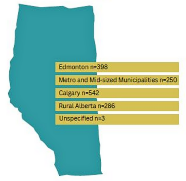
The survey collected data from 1,479 parents.

Survey data was collected between May 30 and July 11, 2022. Parents were randomly recruited to complete the survey if they were at least 18 years old and had children between the ages of zero to five that live with them at least 50% of the time. The data was weighted using the 2021 federal census.