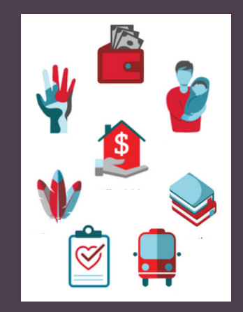
EPE's game changer areas: inclusive economy, antiracism, affordable housing, Indigenization, early learning and care, education, health services, and transportation.

EPE has identified Early Learning and Care as one of the game changers that must be addressed if poverty is to be eliminated in a generation. EPE defines poverty as "when [people] lack, or are denied, economic, social and cultural resources to fully and meaningfully participate in the community" (4). While poverty can affect people across all age groups, children are especially vulnerable to its effects. Fortunately, the ECELC addresses this important game changer.